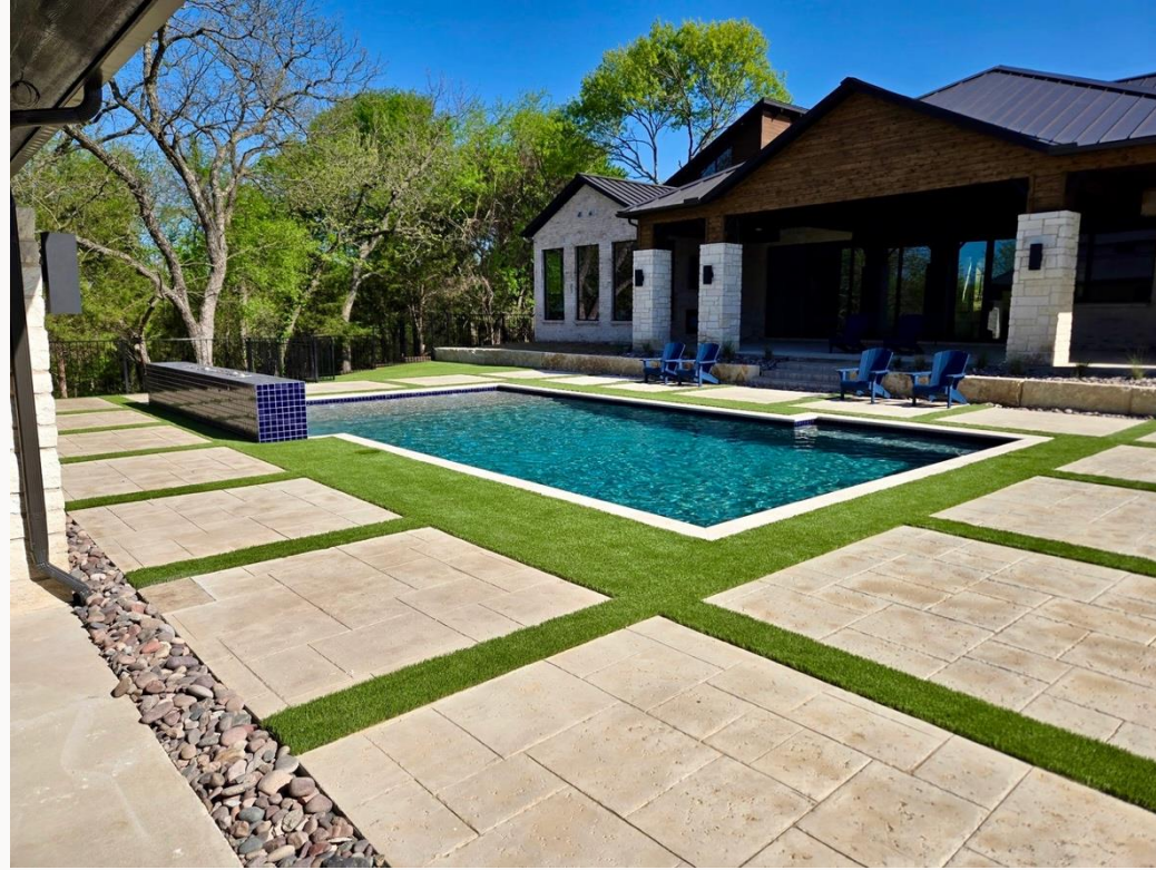
Clubhouse / Pool